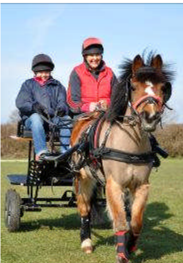
A newcomer to Try Driving

Continuing the success of 2008 Try Driving, the 2009 season proves to be enormously popular and has been met with great enthusiasm.