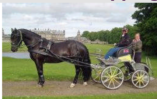
Driving through the woods at Hopetoun

Please send hi-res jpeg images to: sue@bennington.co.uk